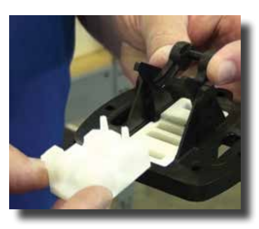
Step 6: Then, remove the white plastic slider.