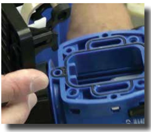
Step 3: Remove the black actuator plate. Set the Medicator aside.