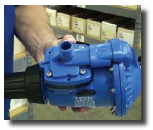
Step 17: Now, reinstall and tighten the six screws in a star pattern.

Step 16: Also note the two raised circles on the black plate, these will allow everything to line up.