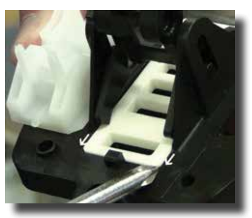
Step 9: Align the arrow on the slider with the two arrows on the actuator plate and install the new slider.