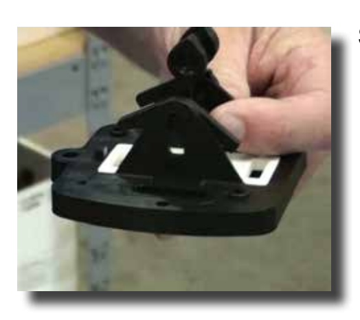
Step 8: To replace, insert the new rocker.