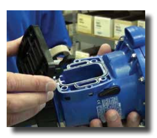
Step 14: Reinstall the assembly into the housing.