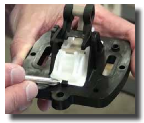
Step 13: Next, position the slider so that the small tooth touches the stop.