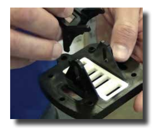
Step 7: To remove the rocker, spread the supports and pull it up.