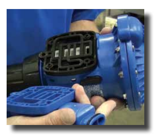
Step 2: Lift it out and remove.

Step 1: If the unit isn't clicking, unscrew and remove the 6 screws from the outlet plate assembly.